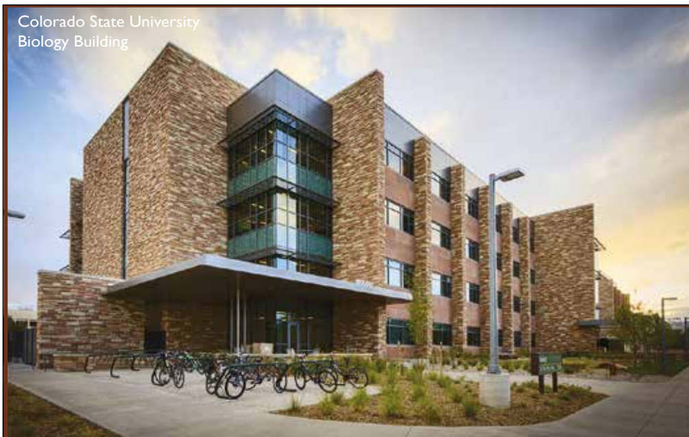
Colorado State University Biology Building